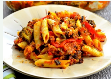
Vegetarian hot dinner